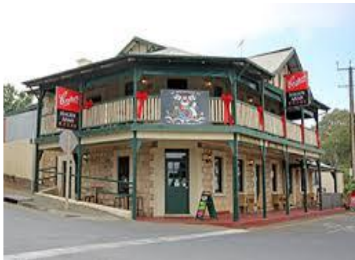
The Hagen Arms Hotel at Echunga