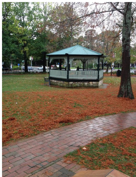
The rotunda at Steamroller Park, Sterling.