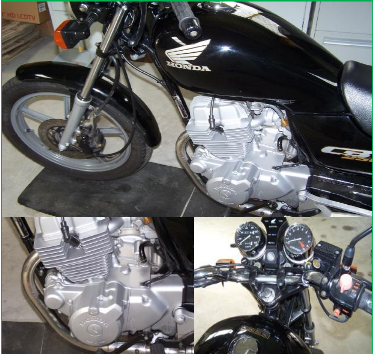
1999 HONDA 250cc $2,200 IN SHOWROOM CONDITION

Collection of motorbikes for trade as follows: $8,000 BMW (1998) R1100 GS - $8,000 BMW (1998) R1100 GS - Showroom condition with all extras; $1,800 KAWASAKI GT 750 (1983) Shaft (Z750P) cosmetically restored, NO rust, motor needs work; $2,200 HONDA 250CC (CB250) (1999) showroom condition. All bikes in the collection are not registered. and are sold "AS IS" - Inspection invited. Priority to preferable trade as package. ALL to be traded for $12,000 - against the Swap and purchase either or of a (1942) to (1945) US Army WW11 Jeep Willys MB and Ford GPW - Cash will be upon agreed difference in Swap.